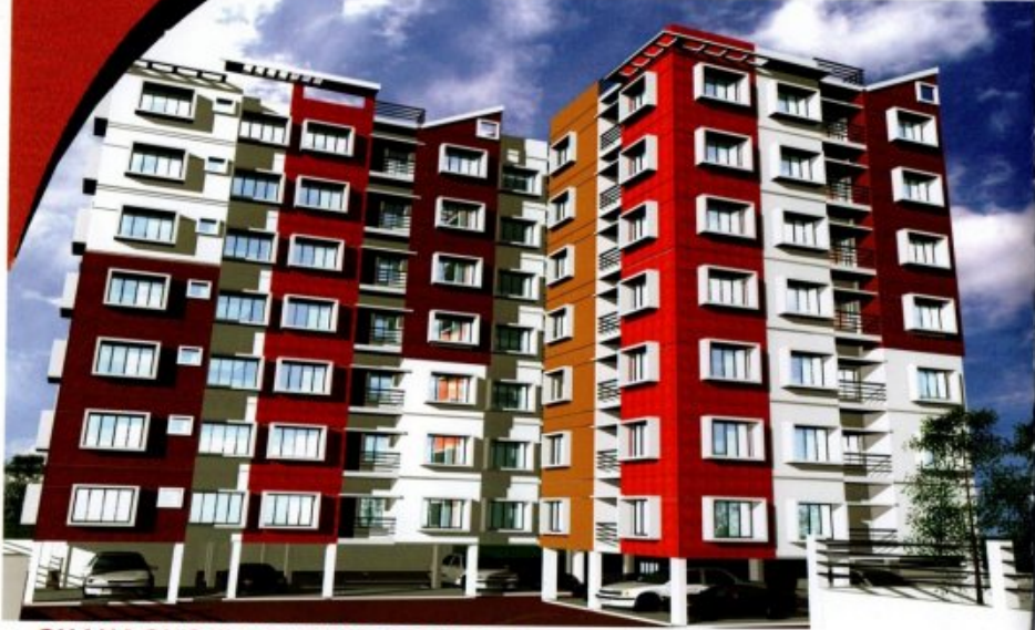
CHAYACHOBI HOUSING COMPLEX